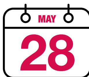
Regional Dinner Fota Island Resort Hotel, Cork