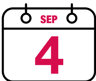
Corporate Golf Day Milltown Golf Club, Dublin