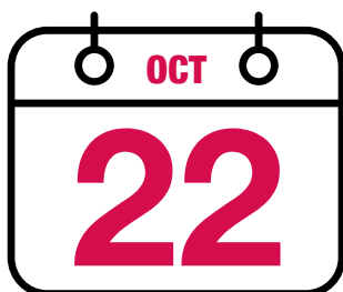
Table Quiz Lansdowne Rugby Club, Dublin