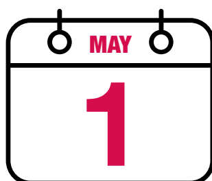
Annual Spring Lunch The Mansion House, Dublin