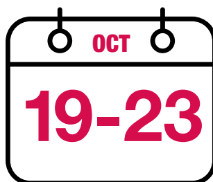
Basis.point week Multiple venues